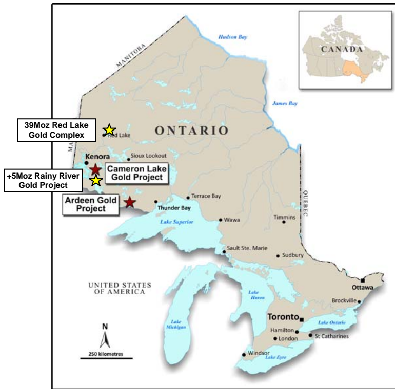
Figure 1. Location of Coventry Resources Limited's Cameron Lake and Ardeen Gold Projects, Ontario, Canada.