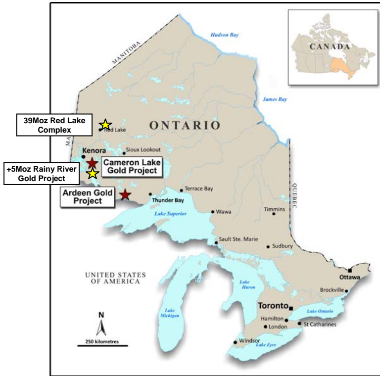
Figure 1. Location of Coventry Resources Limited's Cameron Lake and Ardeen Gold Projects, Ontario, Canada.