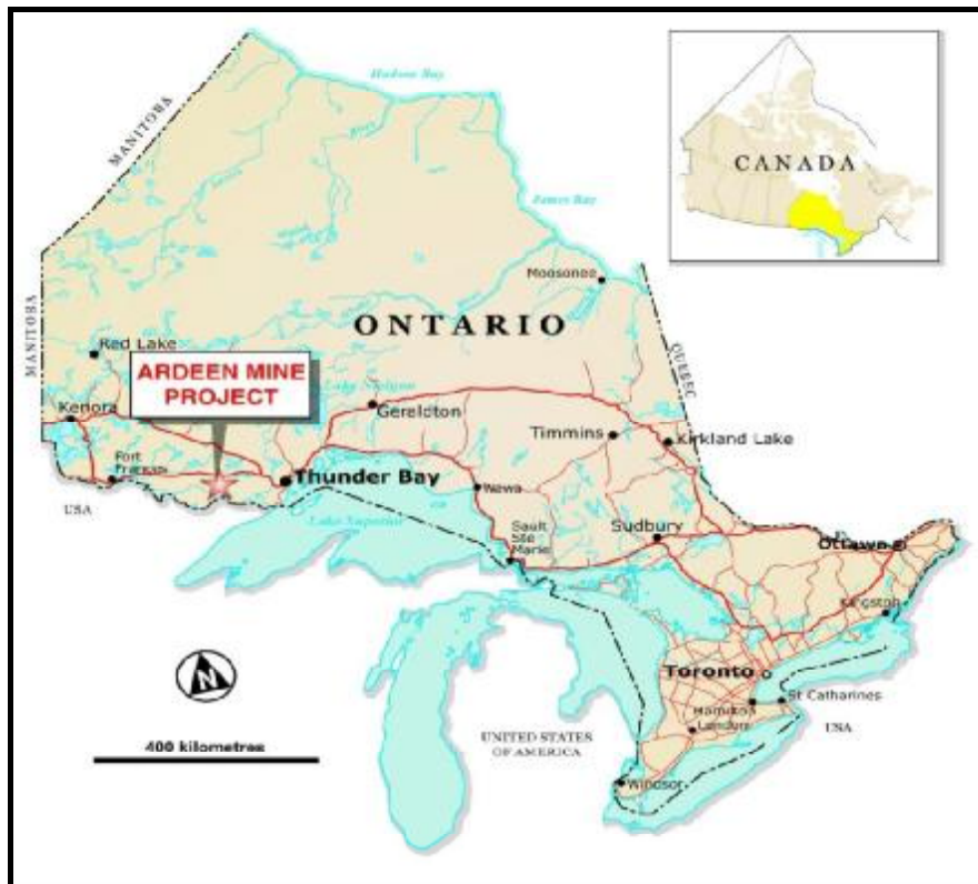
Figure 1. Location of the Ardeen Gold Project, Ontario, Canada.